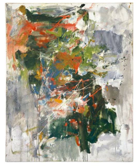
Joan Mitchell, Untitled, 1962 Oil on canvas 63 3/4 x 51 1/8 in / 161.9 x 129.9 cm

Organized in collaboration with the Joan Mitchell Foundation and Cheim & Read Gallery, New York.