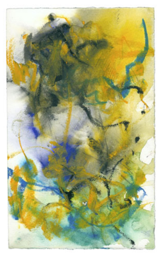
Joan Mitchell, Untitled, 1986 Pastel and watercolor on paper 6 1/2 x 4 in / 6.5 x 10.2 cm