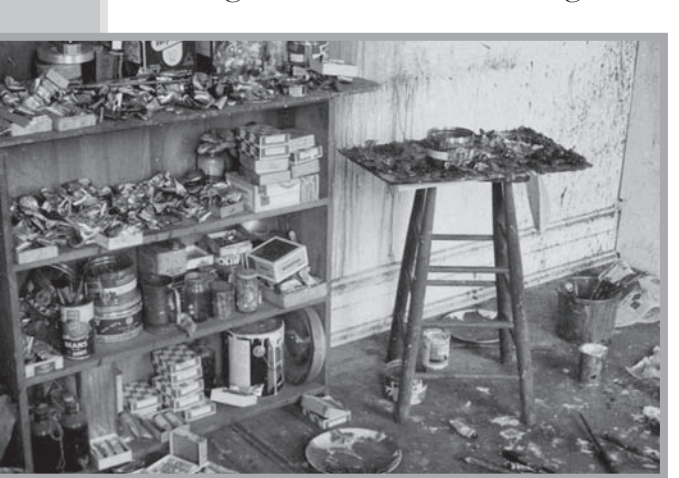
New York, 1957.

Oil paint is made of pigments - substances, often dry powders, that have rich, strong color - mixed with vegetable oils. Colors are very carefully selected and