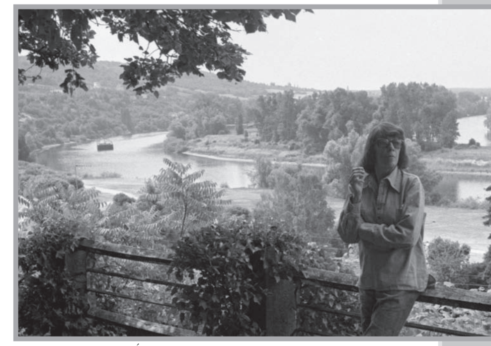
Vétheuil, 1984.

The paint in Beauvais suggests matter in flux between physical states. Oranges, greens and browns seem more solid and anchored in the foreground. The areas of blue paint push forward as well, yet lead like passages back into and beyond the painting. The blues feel permeable, calling to mind a material through which light, objects, or bodies may pass: perhaps solid like a lens or colored glass, liquid like a body of water, or open like air and sky.