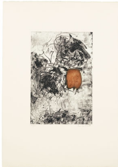
Joan Mitchell, Sunflower II , 1972