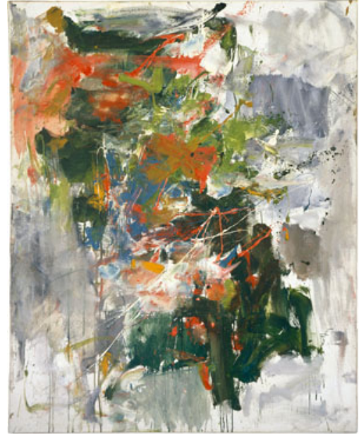
Joan Mitchell, Untitled, 1962 Oil on canvas 63 3/4 x 51 1/8 in / 161.9 x 129.9 cm

Organized in collaboration with the Joan Mitchell Foundation and Cheim & Read Gallery, New York.