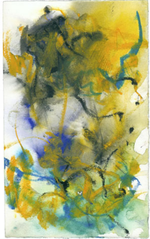
Joan Mitchell, Untitled , 1986