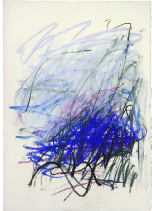
Joan Mitchell, Untitled, 1992 Pastel on paper 29 1/2 x 21 3/4 in / 74.9 x 55.2 cm