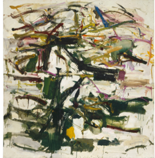
Joan Mitchell, Untitled, 1956 Oil on canvas 73 x 73 in / 185.4 x 185.4 cm